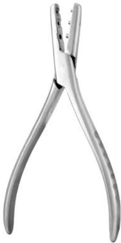
Modelling Lever ML