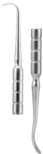
McIndoe Cleft Palate Raspatory MCPR