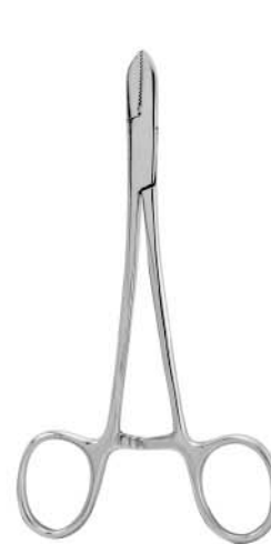
Wire Twister WTL