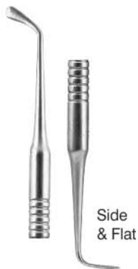
Cleft Palate Elevator CPE2