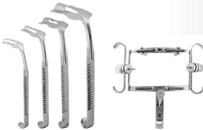
Dingman Mouth Gag with 4 Baldes DMG