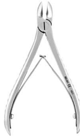
Bone Cutting Forcep Single Action RBC