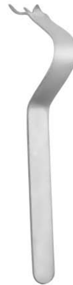
Chin Retractor CR