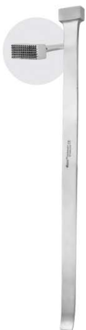
Pterigoid Chisel PC