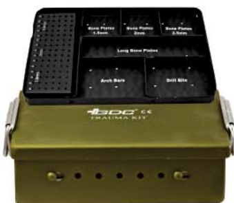
Trauma Kit TRAUMA