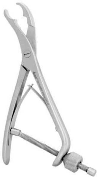
Bone Holding Forcep (Mandible) BHM