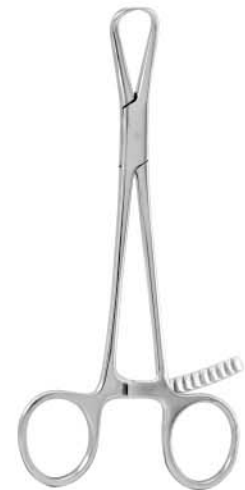
Bone Holding Forcep Pointed BHP