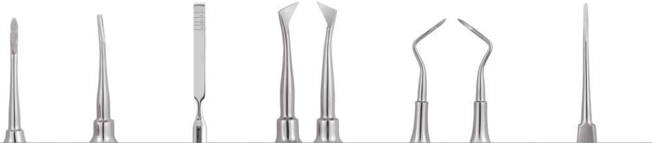
London Hospital E20H