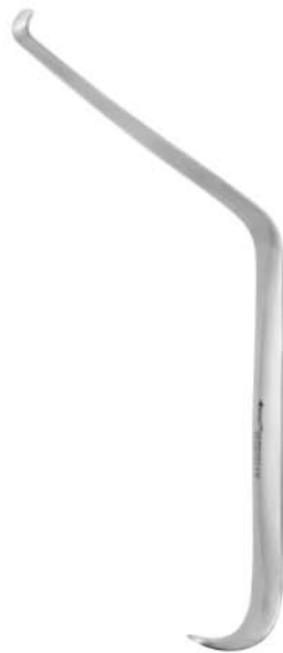
Channel Retractor Regular CHR