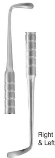
Cleft Palate Elevator CPE1